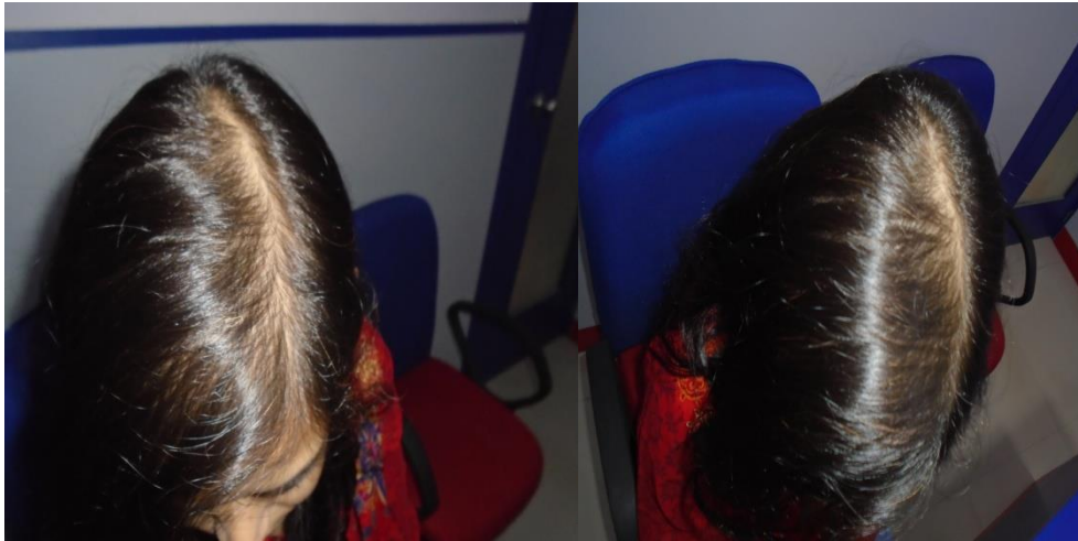
Figure 4: Before treatment