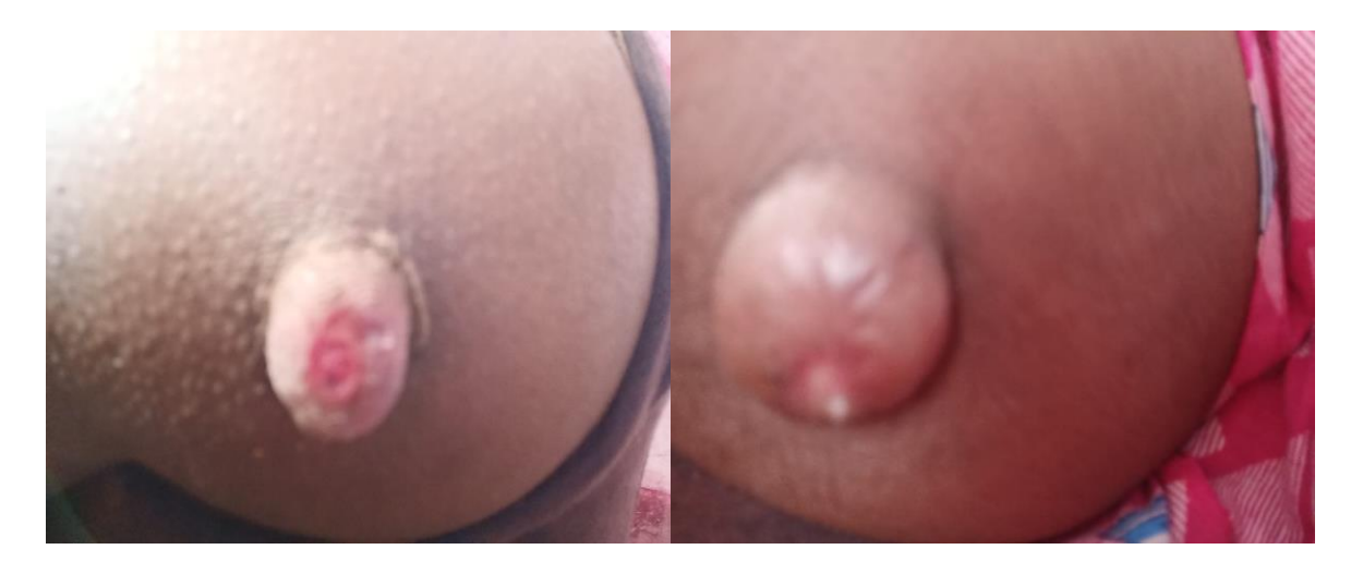
Fig: Dated on, 20/05/2021